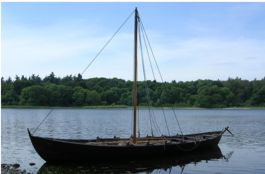
Faroese Boat, Viking Ship Museum, Roskilde, Denmark 2005.