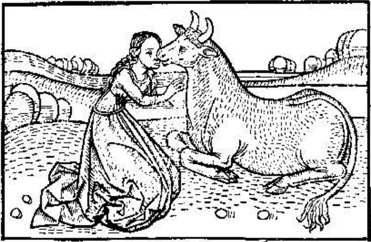
A bull and a maiden; from the Defensorium Virginitatis Mariae , 1471.