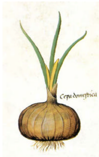
Onion; Platearius, Le Livre des simples médecines .