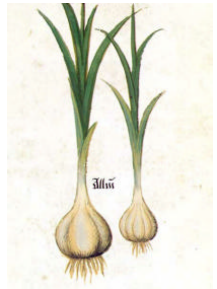
Garlic; Platearius, Le Livre des simples médecines .

Barony of Southron Gaard October AS XLII (2007)