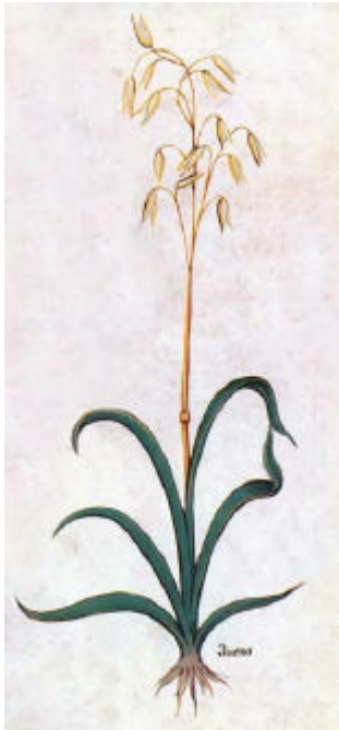
Oats; Platearius, Le Livre des simples médecines , 1480.