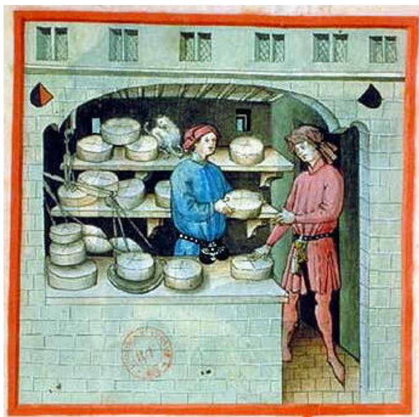
A cheese merchant; Tacuinum Sanitatis , 15th c., Paris