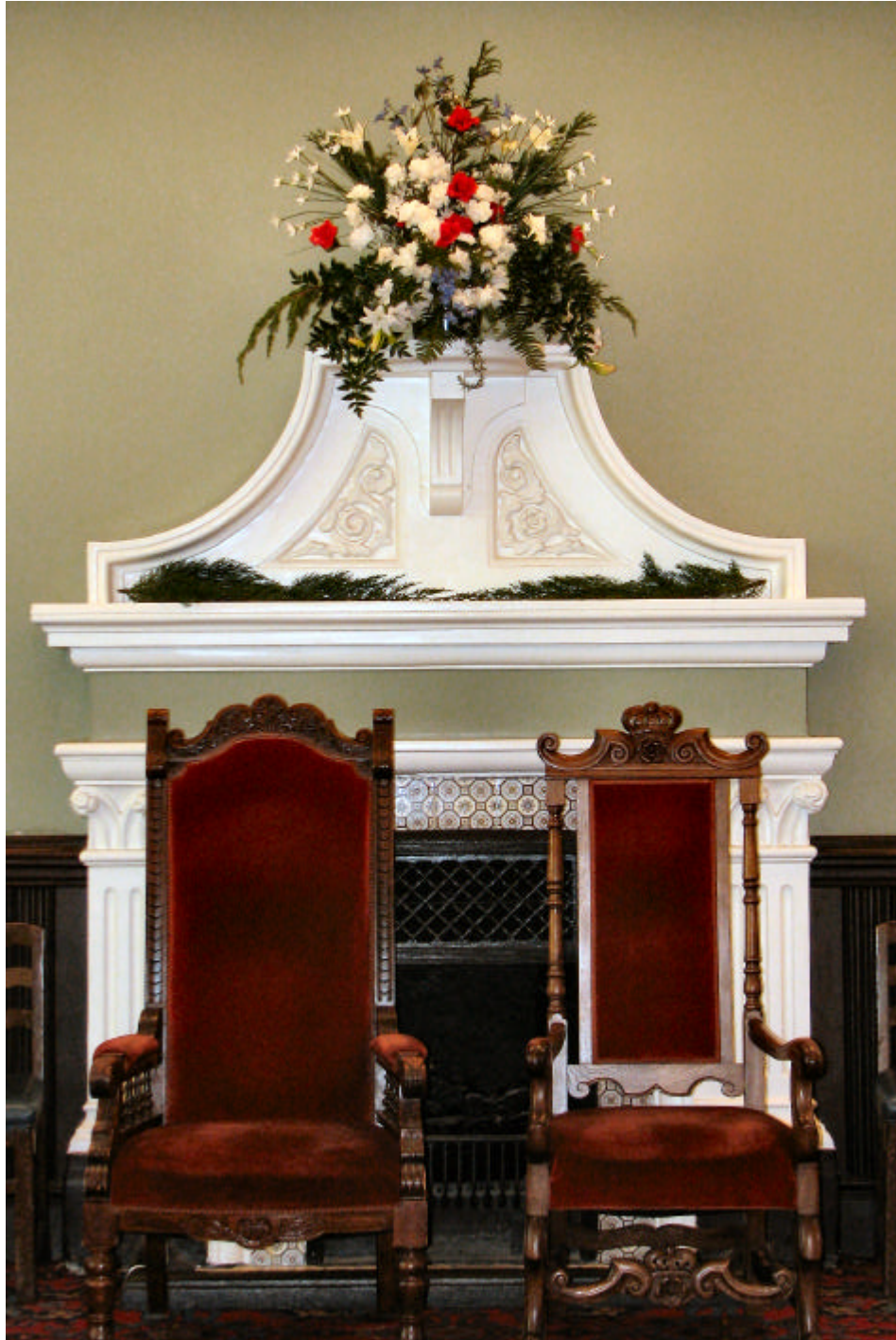
The Baronial Chairs in preparation at Bal d'Argent

Barony of Southron Gaard October AS XLI (2006)