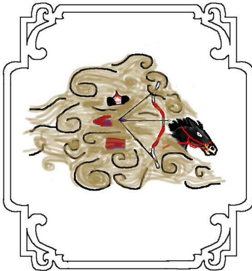
Golden Flight II – Attack of the Mongols