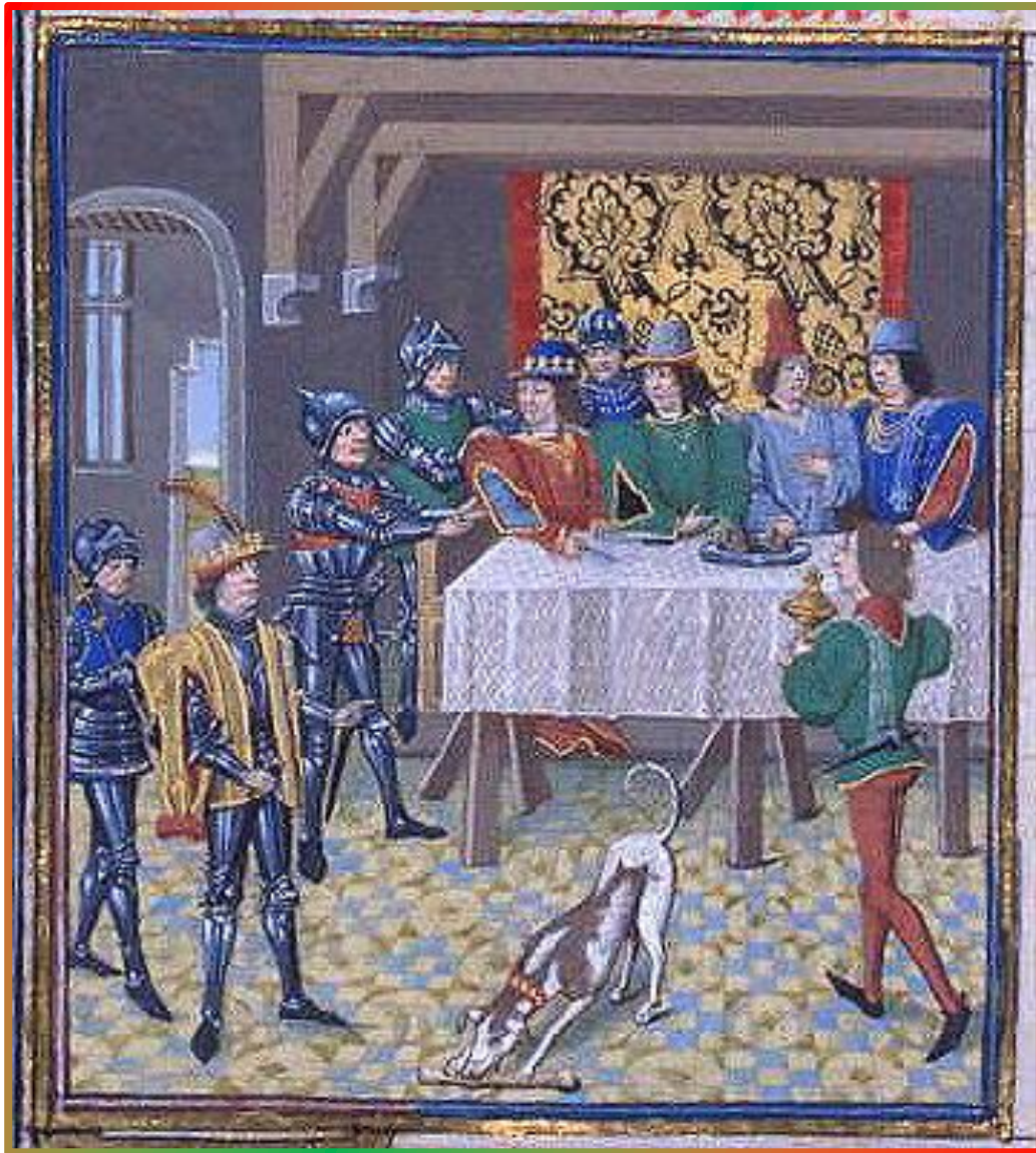
Feast scene of noblemen and knights