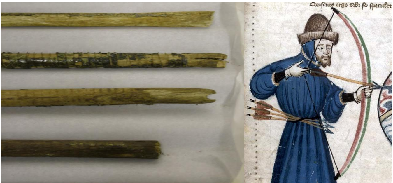
Mary Rose arrows (left). Note the green colour around the fletching (right), and black thread binding each end of the fletches. Vox Clamantis (Hunter 59, fol. 6v), c. 1400

The nock ends of the Mary Rose arrows were made by first cutting a slot of approximately 2" into which a thin sliver of horn (called a nock piece) was probably inserted, and then across this was cut the slot to take the string - quite different from bulbous nocks commonly seen in period illustrations of people with recreational or hunting arrows. Just below the nock, spiral indentation marks at about 6 per inch can be clearly seen where thread had held the three fletchings 6 1/2" long. The greenish substance, likely to be a copper compound, could be fletching glue or a paint to identify arrows. It has been suggested that it was an application of verdigris to prevent insect damage whilst they were being stored ( http://www.fletchers.org.uk/historyarrowmaking.html ). Green colour is occasionally shown around the fletching in manuscripts, occasionally red, but usually no distinguishing colour.