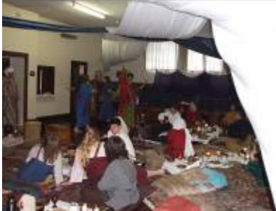
Dancers perform to live drumming

Graced by Their Excellencies and a Middle Eastern Dance expert, the Hafla provided a tantalising taste of the Middle East.