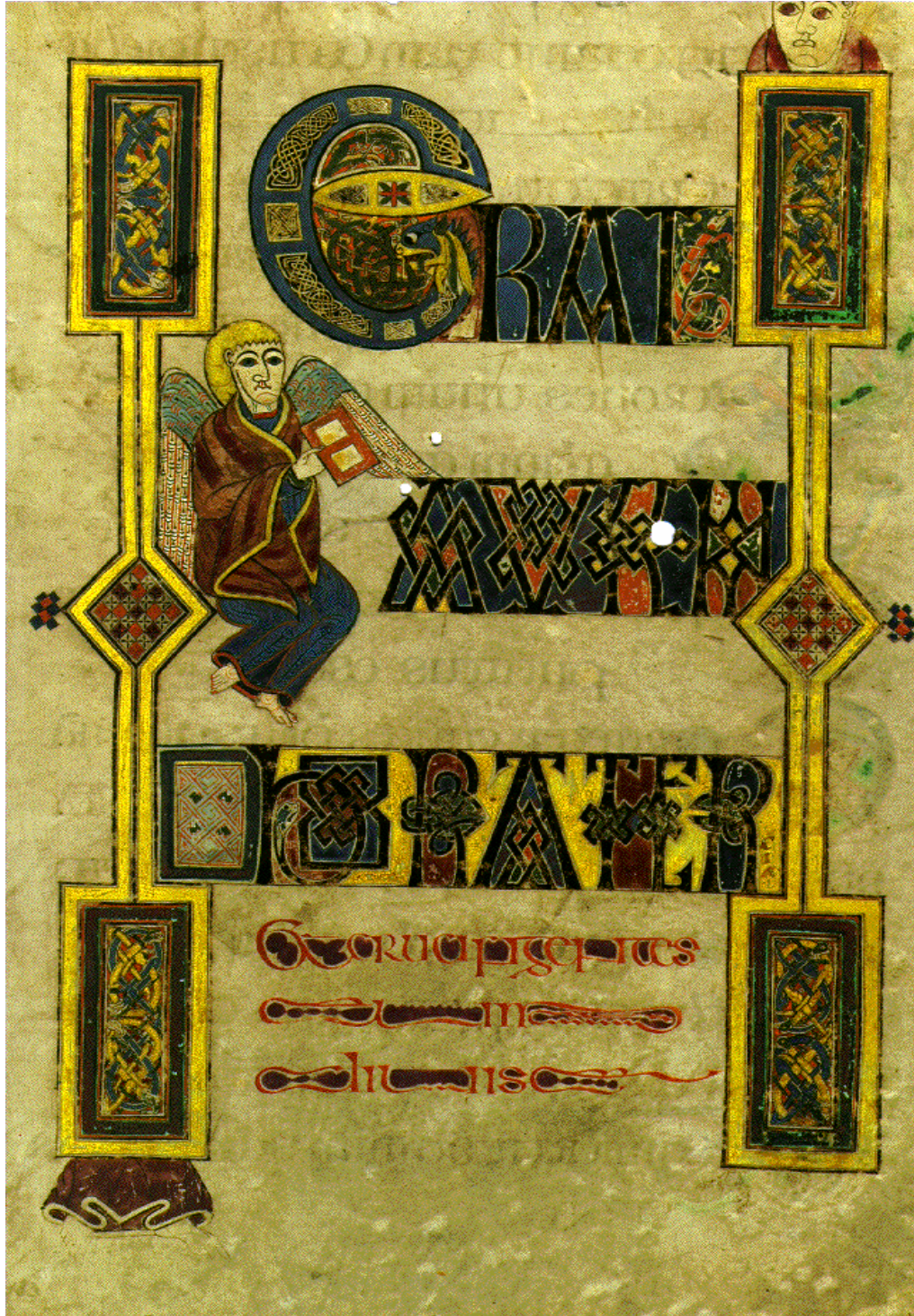
A Page from the Book of Kells

Barony of Southron Gaard January AS XLI (2007)