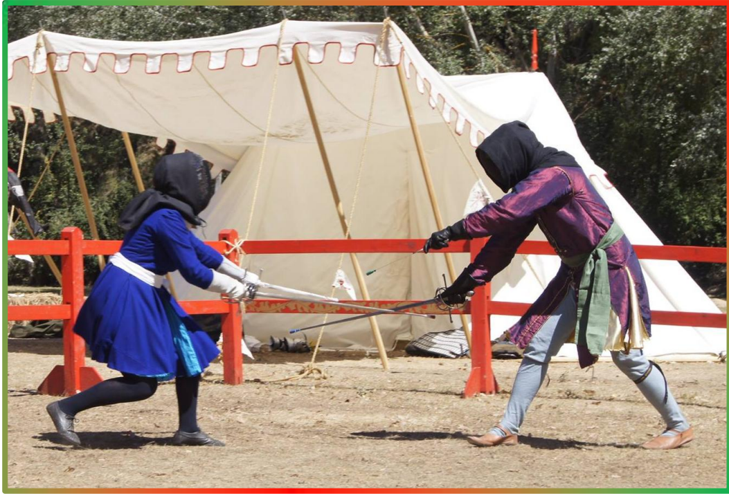
A duel between two rapier fighters at Canterbury Faire.