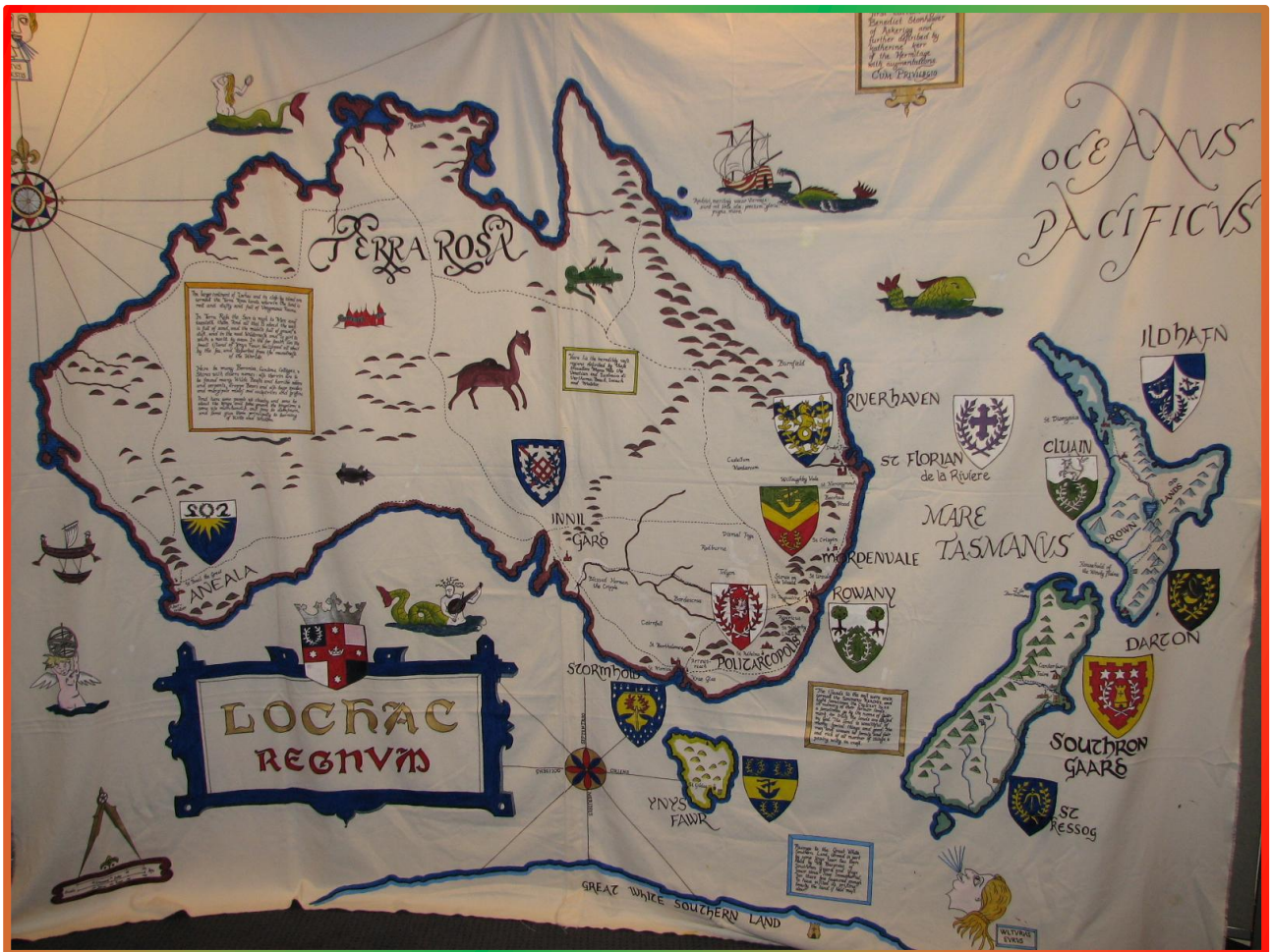
Map of Lochac from coronation of 2007 in Christchurch