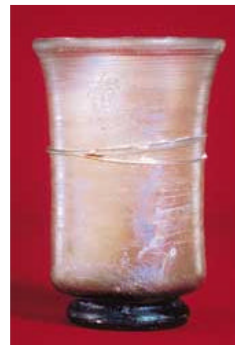
Wine beaker Late 4th century A.D. Ht., 11.7 cm

http://www.museum.upenn.edu/new/research/Roman%20Glass/index.html