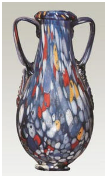
Two-handled polychrome jar Ht., 11.7 cm Mid-to-late 1st century A.D. From Lebanon