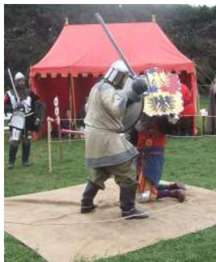
Holmgang at Spring Thing

This is the September 2015 issue of From the Tower, a publication of the Barony of Southron Gaard of the Society for Creative Anachronism, Inc. (SCA, Inc.). From the Tower is only available online on the Southron Gaard website at http://sg.lochac.sca.org/docs/ftt/ . It is not a corporate publication of SCA, Inc., and does not delineate SCA, Inc. policies.