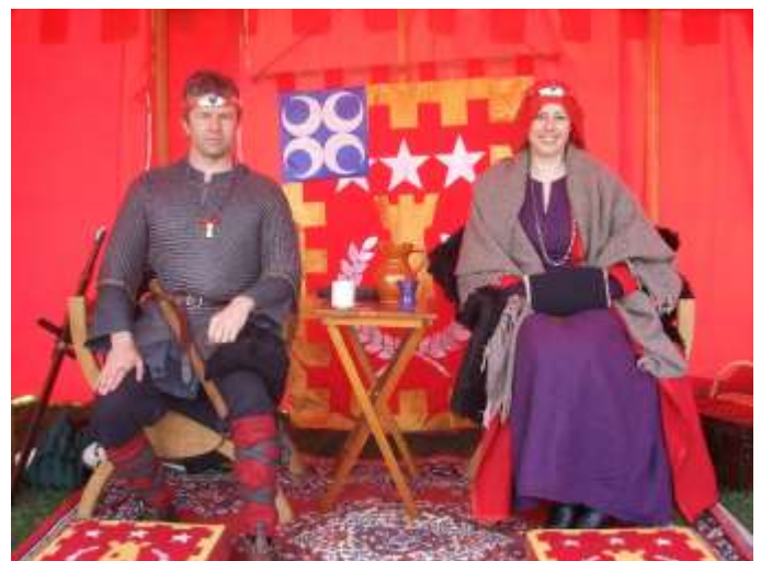
Their Excellencies at the Spring Thing

We wish you all unhurried and effective preparations for Twelfth Night and Canterbury Faire.