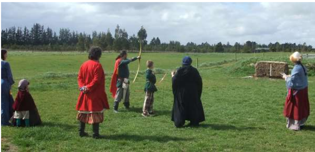
Archery at Spring Thing