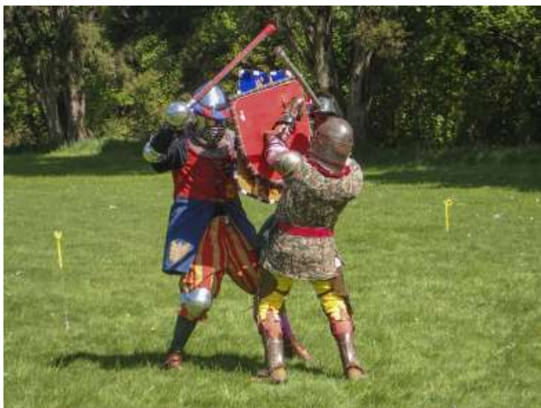
Fighters at The Spring Hunt