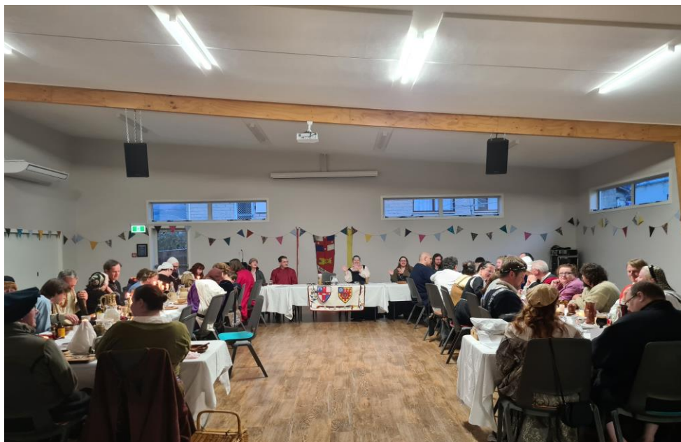
Feasting at Gildenwick