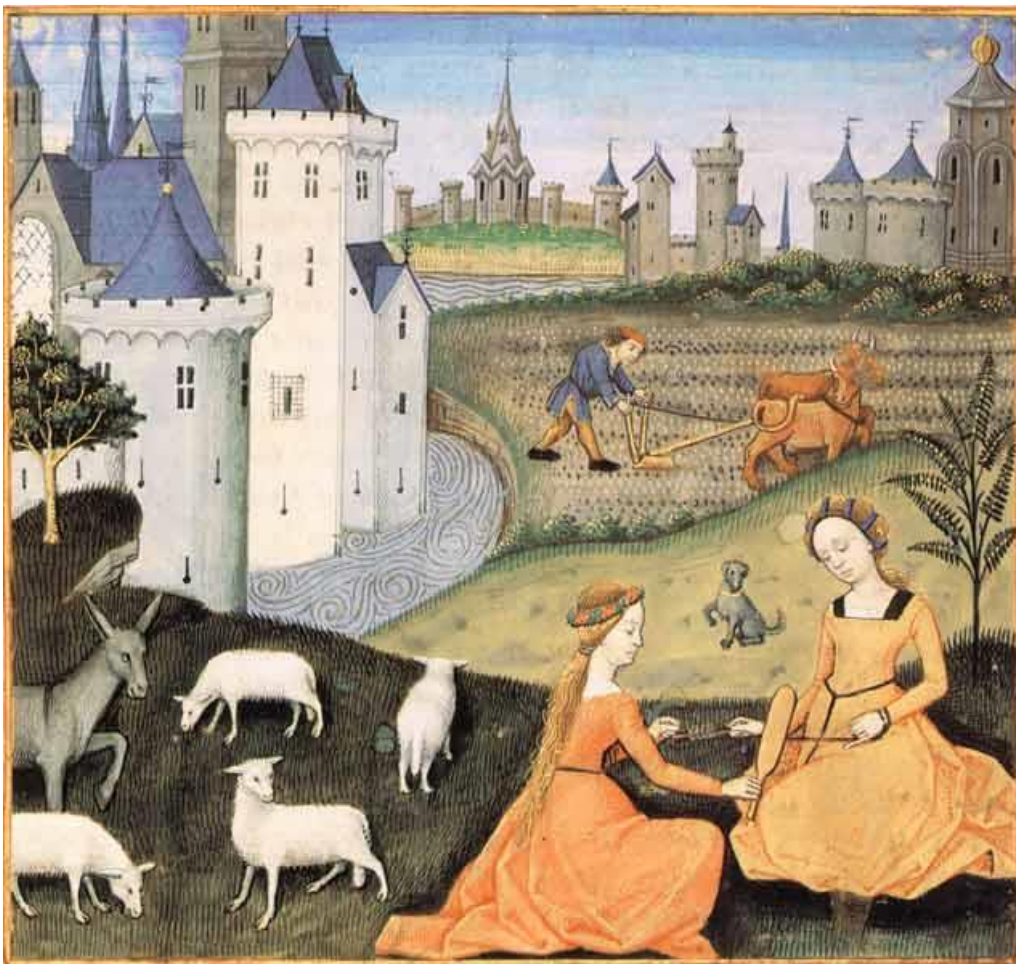
Maître de Charles d'Angoulême, Les secrets de l'histoire naturelle, contenant les merveilles et choses mémorables du monde , 1485, Paris.