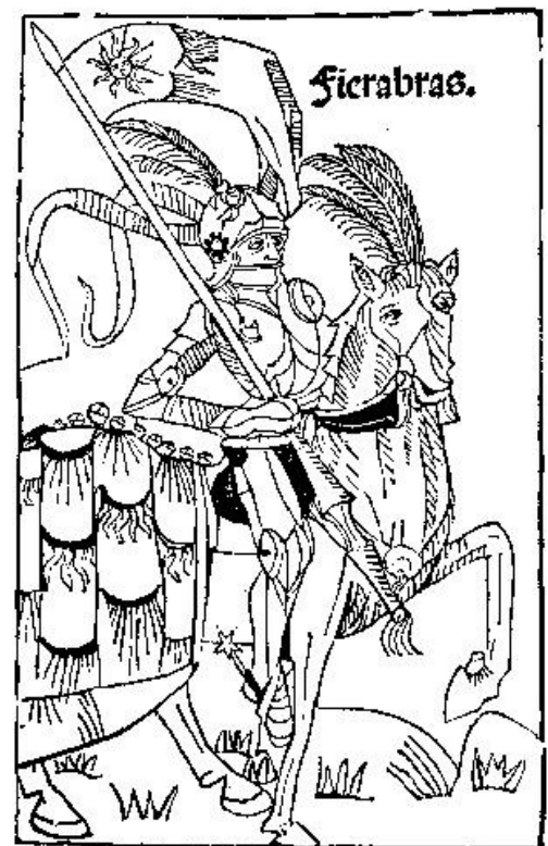
Knight on horseback; from Fierabras , Lyon, about 1485

Come along to practices and get used to being around horses. You can learn how to handle the horses, tack and groom, help with resetting and scoring the games. Do let us know if you want to learn – we'd be happy to take time out to show you things if you ask.