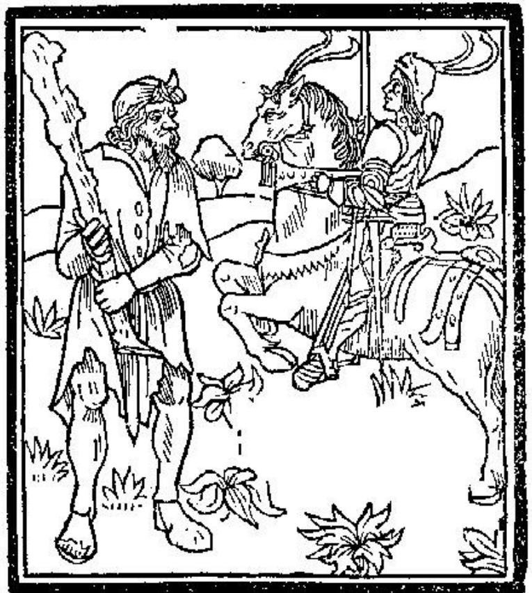
Le Chevalier and Accident, from Le Chevalier Délibéré , Paris 1488

If allowed to feed a horse place the feed in